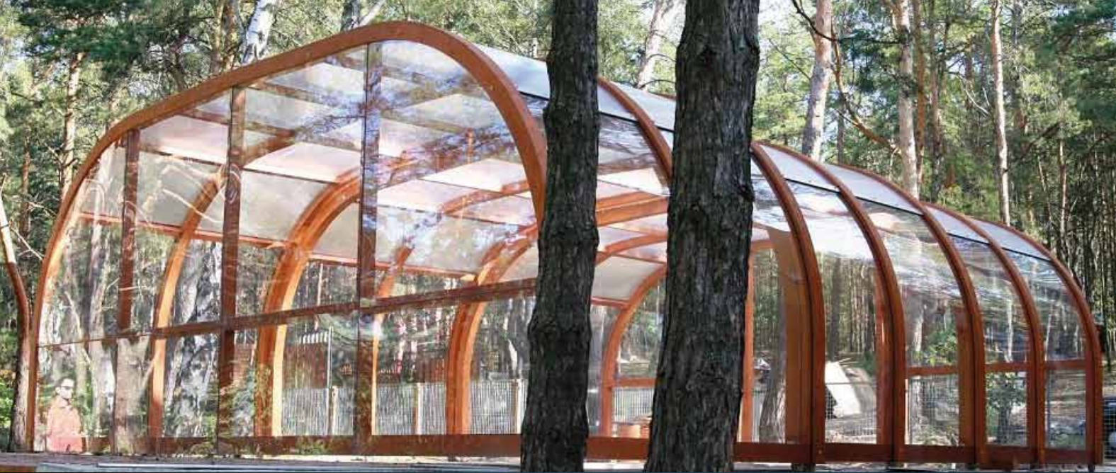
Swimming pool retractable covers