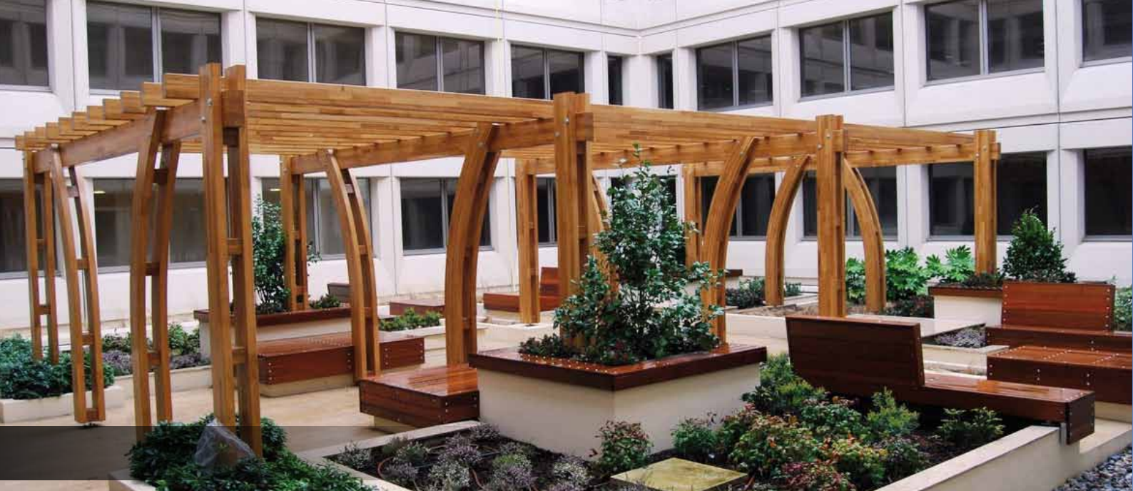
Commercial and storage buildings