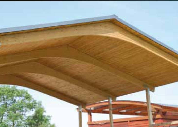
Small sports and leisure halls

their way into hundreds of unique products;