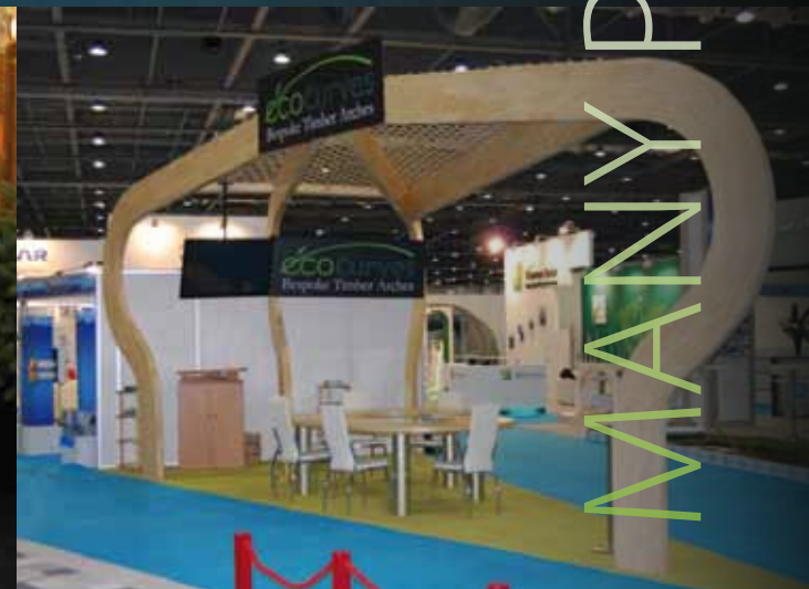
Trade fair stands